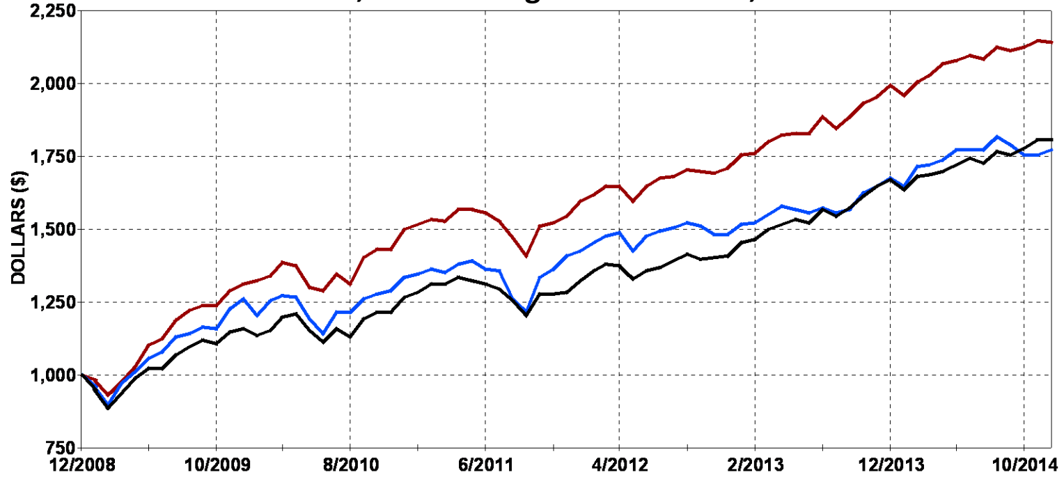
December 31, 2008 through December 31, 2014